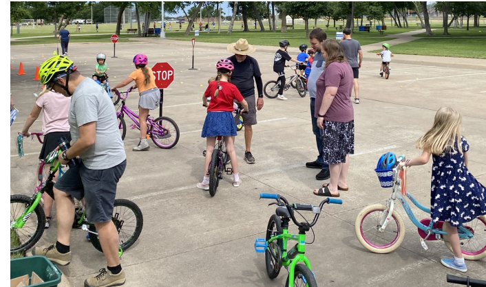
Richardson Bike Rodeo Event, 2025

Free event planning and promotional resources at www.nctcog.org/walkbikeroll