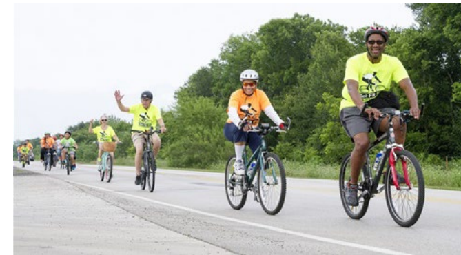
Grand Prairie Ride with the Mayor, 2026