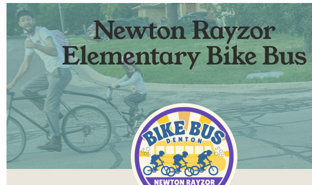
Bike Bus Denton: Newton Rayzor www.bikebusdenton.org