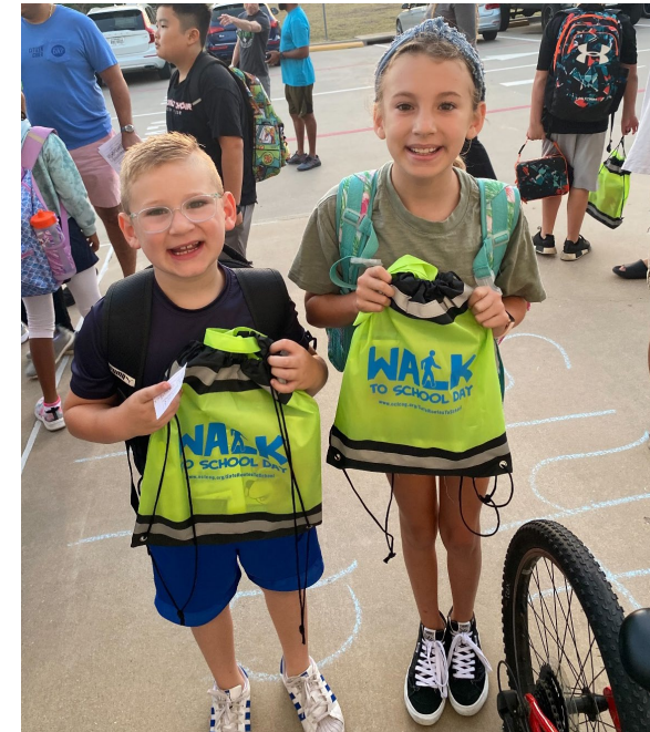
Nichols Elementary: 2022 Photo Contest Winner