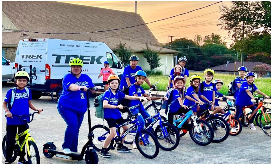
Miller Elementary, 2023 Walk & Roll to School Day Participant